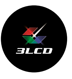
Remarkable image quality 3,000 lumens of color/white brightness with innovative 3LCD technology.