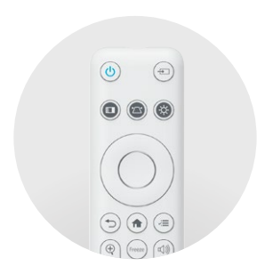
Easy to use User-friendly remote with innovative design.