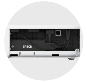
Enjoy easy access to online content by connecting the Android TV<sup>™</sup> dongle to the projector