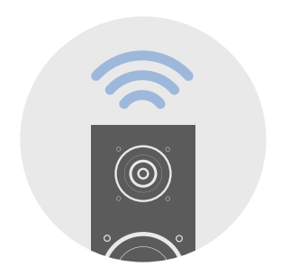
Bluetooth connection that supports external speakers