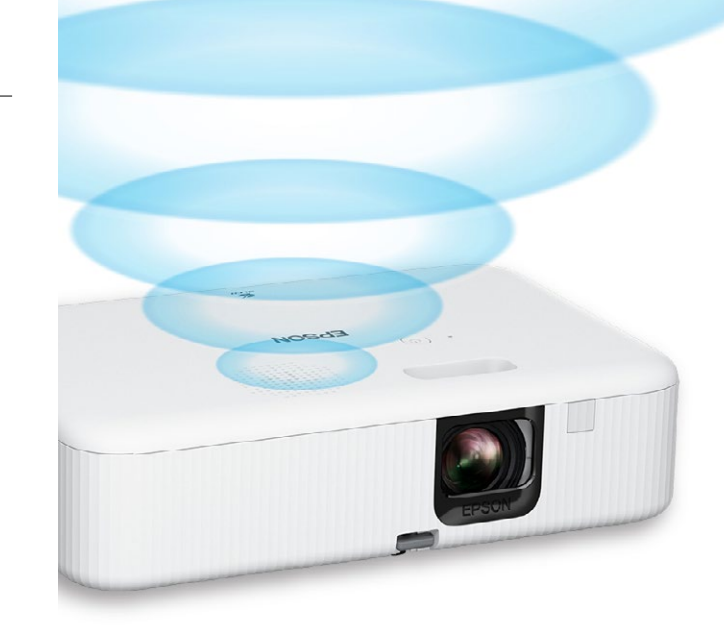
Top speaker placement for optimal sound quality.

The projector also boasts a powerful sound output of 5W and can project wirelessly. Altogether, the CO-FH02 is a well-rounded projector that provides users a multitude of visual experiences with its in-demand features which were designed to meet all of one's lifestyle needs.